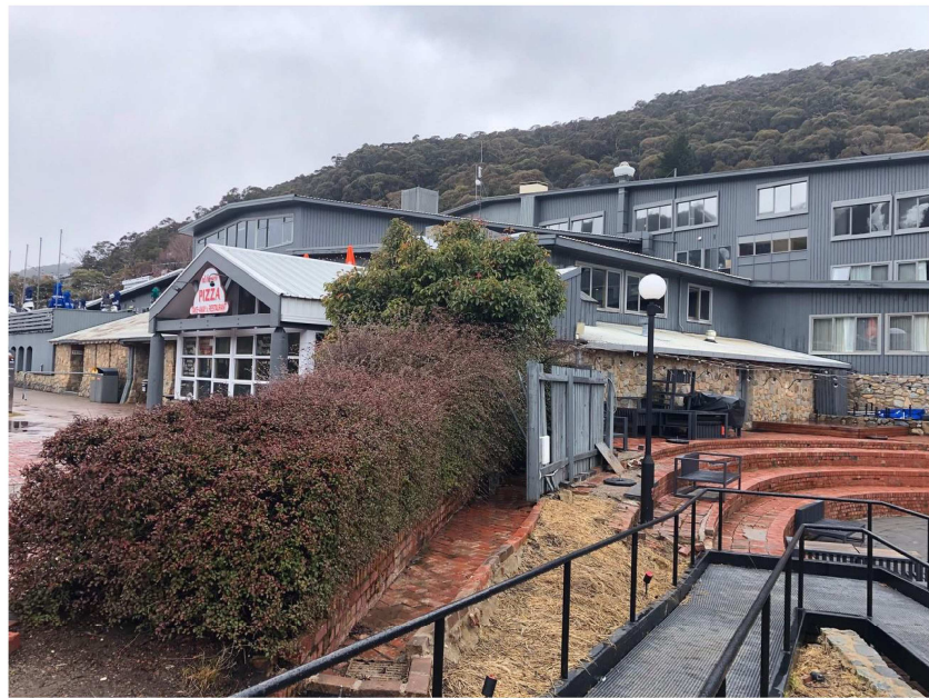
WINDOWS ON NORTHERN FACADE OF ALPINE HOTEL